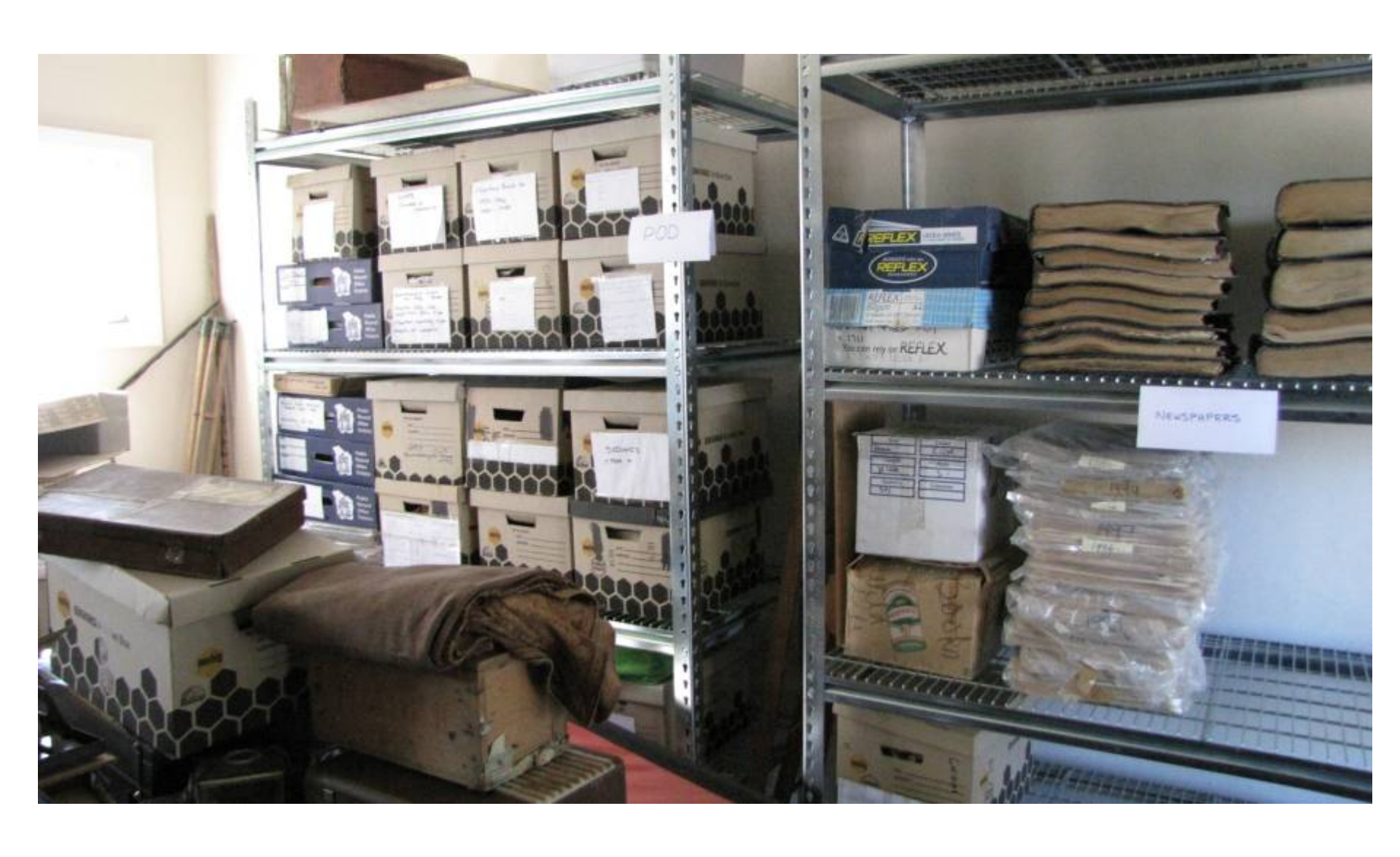
Museum storage & archive room