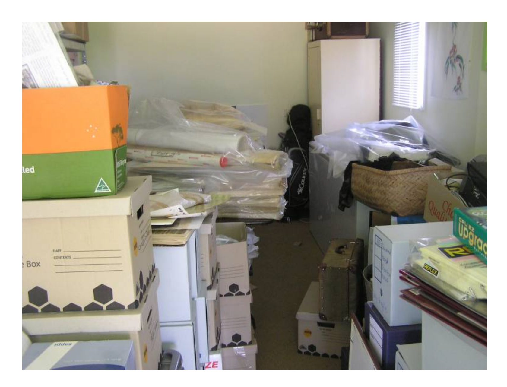
Temporary storage on the farm