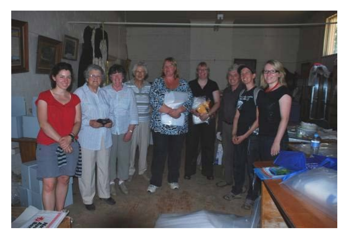
Working bee volunteers