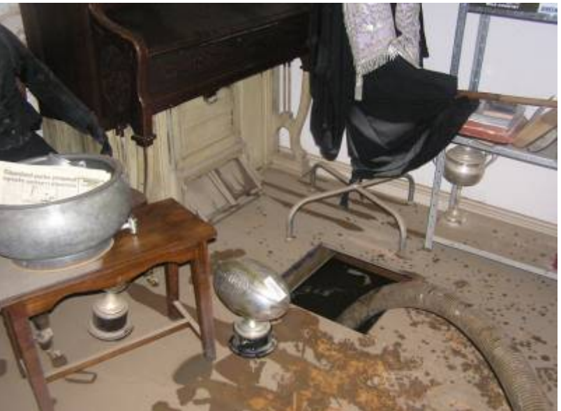
January 17<sup>th</sup> 2014 – Research room