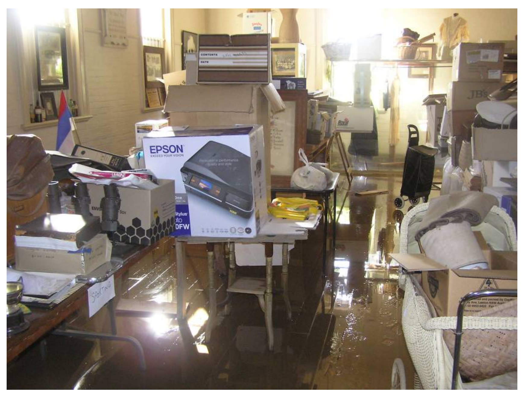
January 15<sup>th</sup> 2014 – Main display room