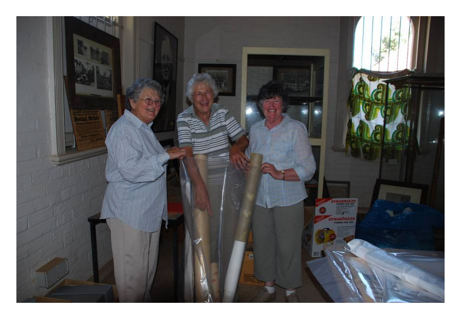
Working bee – Donald History & Natural History Group