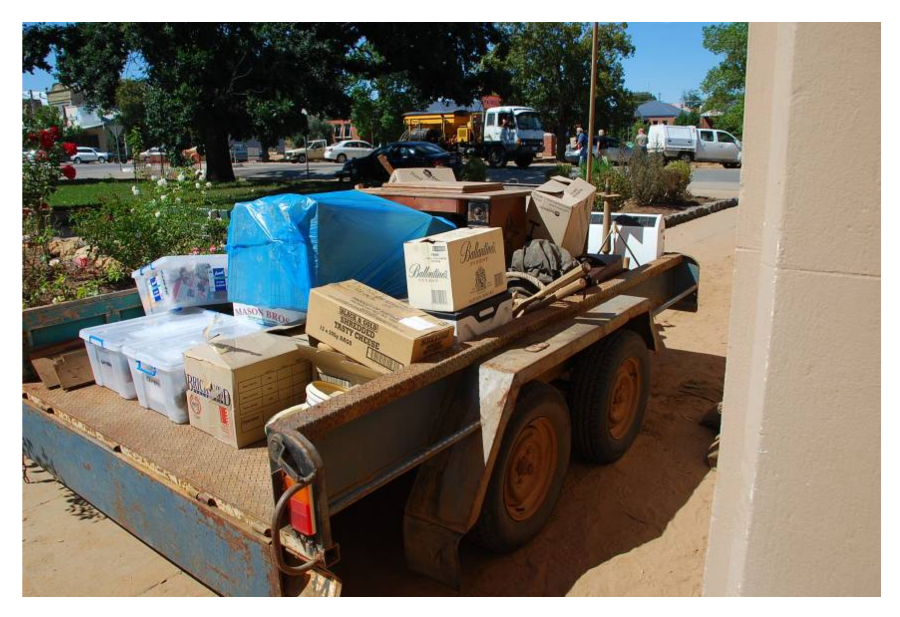
One of many loads out to the farm at Yeungroon (14km from Charlton)