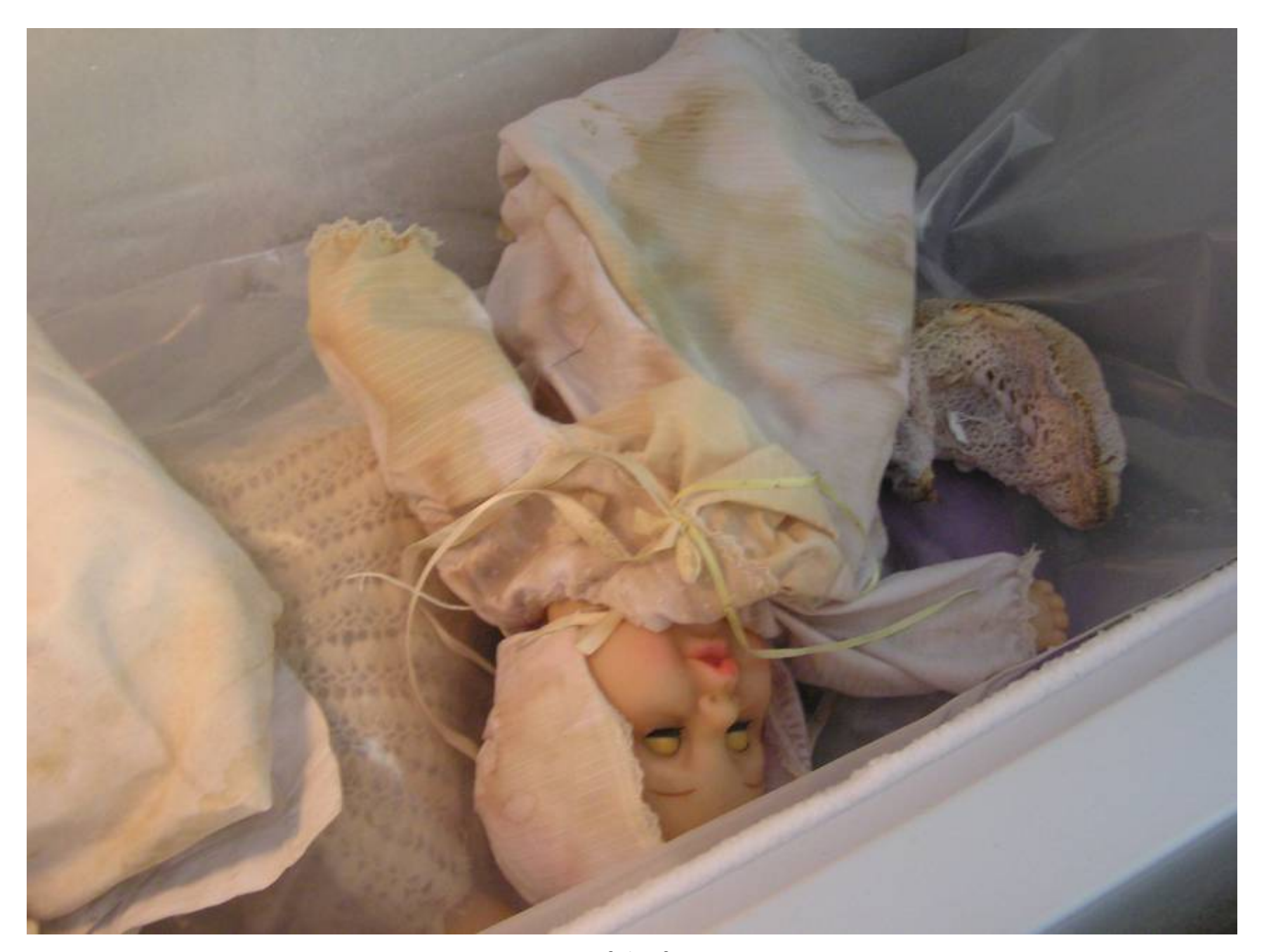
Contents of the freezer