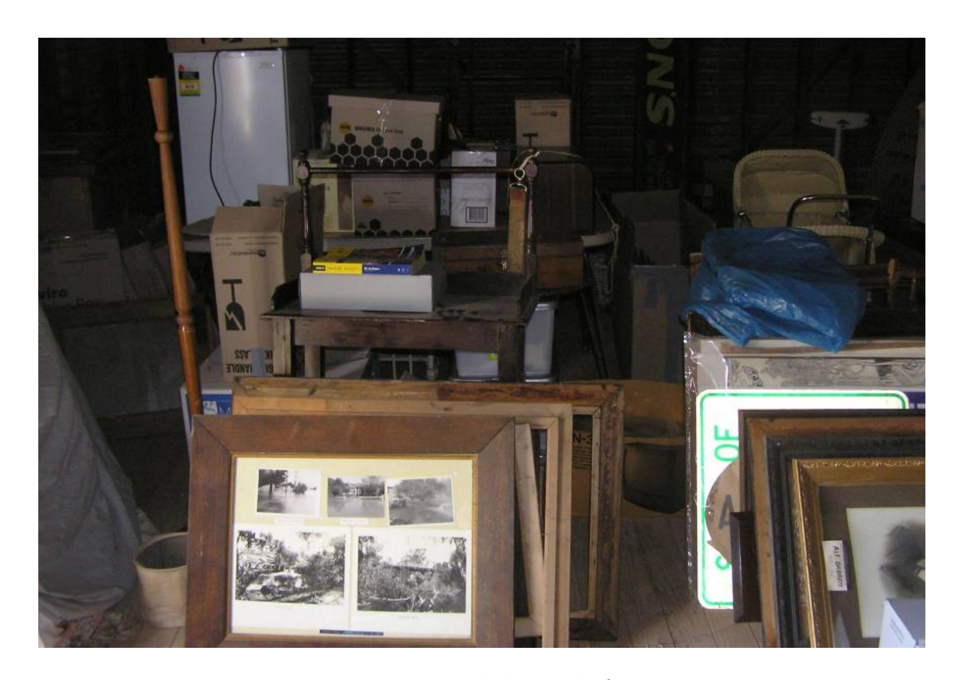
Temporary storage – the barn on the farm