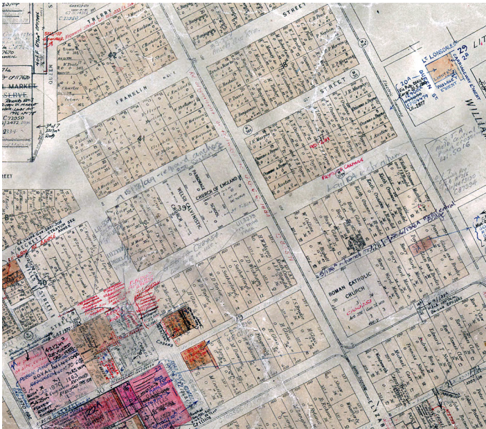
Detail of the map of the Parish of Melbourne North. Little Latrobe Street was later constructed through the centre of Section 37 (towards the top on the right). PROV, VPRS 16171/P1 Regional Land Office Parish and Township Plans Digitised Reference Set, Parish and Township Plans (L-Me), Melbourne -2A in the Parish of Melbourne South, Imperial measure M11 (5514).

As the settlement of Melbourne grew, so too did the need for a system to regulate its residents, and on 22 October 1841 an Act of Parliament divided the settlement into four wards – Bourke, Latrobe, Gipps and Lonsdale. For rate-paying purposes, Little Latrobe Street fell within the north-east section of Melbourne in the Ward of Gipps, though it is not recorded in the rate books for that ward until 1851.[2] It appears, therefore, that the street did not exist when the original parish map, which is undated, was drawn up. Rather, it was added some time between 1850 and 1851, through the centre of Section 37. This means that Little Latrobe Street was not included in the original 1837 layout of the city's grid with the other 'little' streets, but developed much later. It is significant that Little Latrobe Street was constructed around 1850, as there was a huge influx of immigrants into Melbourne at that time following the discovery of gold in Victoria and, clearly, more space was needed to cope with the rising population. Little Latrobe Street thus came to exist in a much more 'natural' way than the streets of the grid, developing as the city itself was growing, out of a need rather than a structured plan.