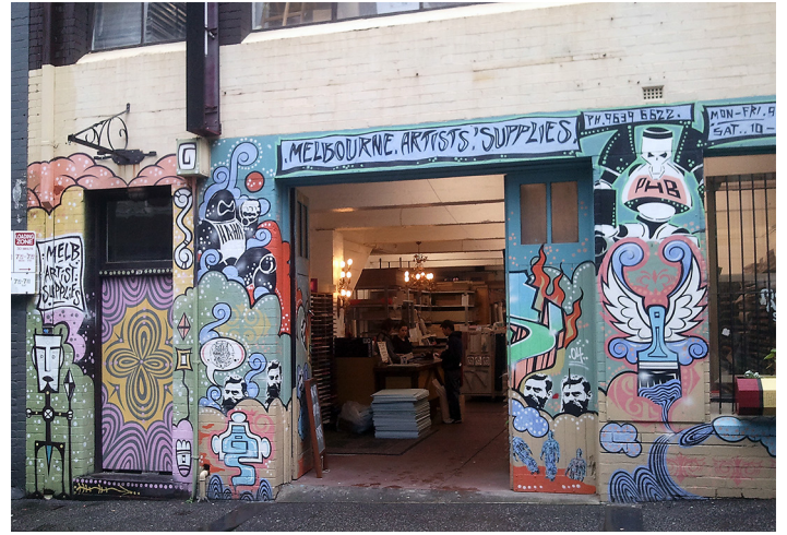
Melbourne Artists' Supplies store. Private collection.