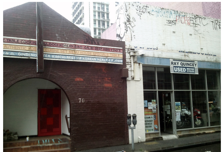
Ray Quincey Used Motorcycles (building on the right).