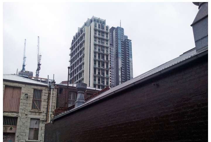
Skyscrapers surrounding Little Latrobe Street. Private collection.