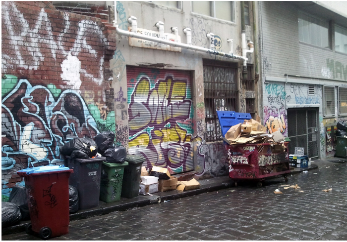
Service alleyway off Little Latrobe Street. Private collection.