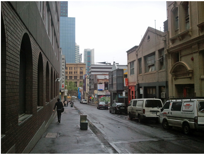
Little Latrobe Street today, looking towards Elizabeth Street.