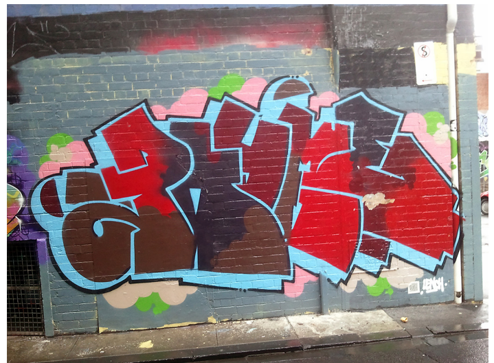
Graffiti art in Little Latrobe Street. Private collection.

as its history. The smaller, hidden alleyways winding through the depths of the city blocks have become particularly popular amongst Melbourne's artists and young people, inspiring the creation of the Laneway Music Festival in 2004. Laneways, including Little Latrobe Street, are also favourite sites amongst graffiti artists to create their constantly changing artworks.