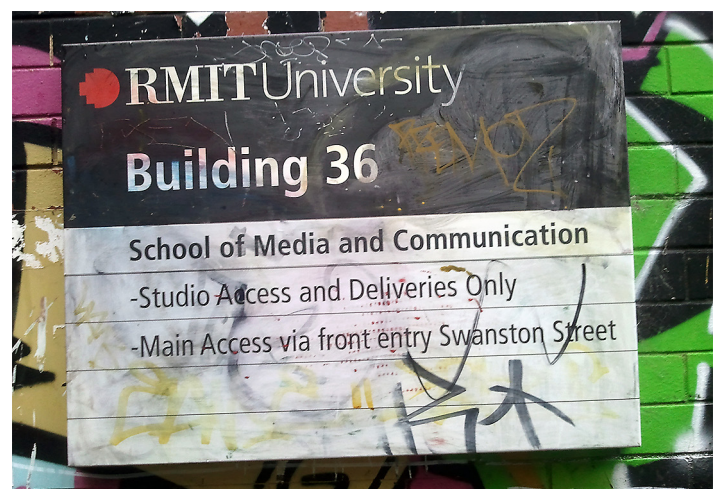
RMIT University sign in service alleyway off Little Latrobe Street. Private collection.

The Building Application Index also confirms that many of the buildings seen in the street today date from more recent times. It reveals, for example, that a two-storey brick building occupied by James McNamara, the collar maker in the 1890s at number 46 Little Latrobe Street, was demolished in 1986 and a three-storey 'shop/office' built in its place.[14] Today the building is an apartment block, surrounded by several other modern buildings that also appear to be apartments. Though many of Little Latrobe Street's original buildings are now gone, signs of its history do remain. The alleyways running off the laneway on both sides are still being used, servicing both the buildings fronting Little Latrobe Street and buildings fronting Latrobe and A'Beckett streets. The sign on an RMIT University building in Little Latrobe Street demonstrates this continuing use. What is more, these cobblestoned alleys continue to provide out-of-the-way areas to store rubbish, just as they would have done 150 years ago.